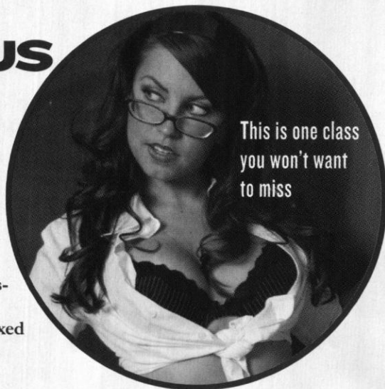
This is one class you won't want to miss

The debate rages on, and the outcome could determine whether future freshmen will just be going off to college or getting off in college (or, more accurately, get-