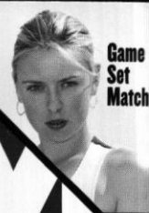
Game Set Match

EXCLUSIVE: YOUR BEST HAIR-LOSS FIXES p 56